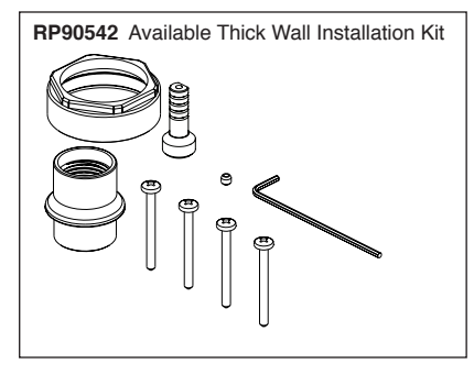
▲ Designate Proper Finish Suffix